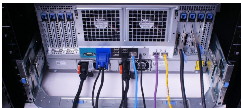
Figure 1. System with cables installed

Attach the CMA tray to the back of the rails as described in the CMA Installation Instructions provided in the CMA kit. Connect all applicable cables to the rear of the system and verify that all connections are secure. See Figure 1.