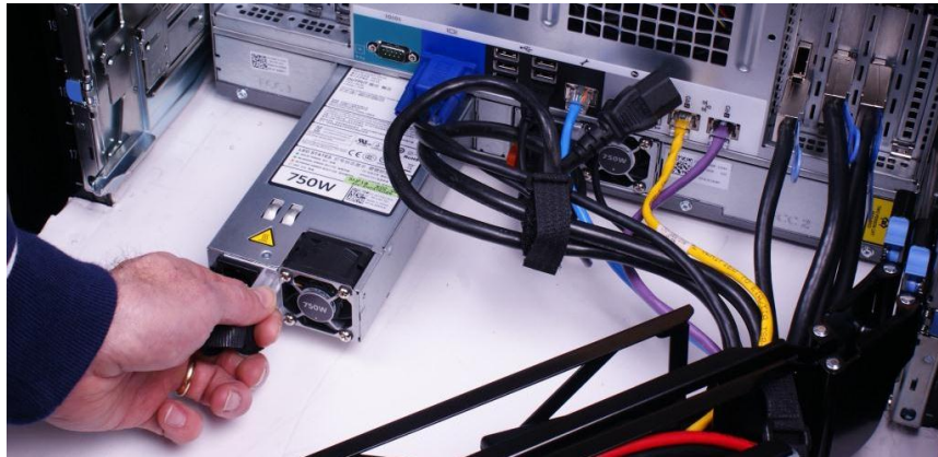
Figure 6. Replacing the power supply