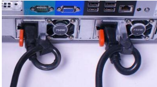
Figure 2. Routing power cables through the strain reliefs

After you have installed the tray and cables, route the power cables through the strain reliefs located on the power supply handles as shown in Figure 2.